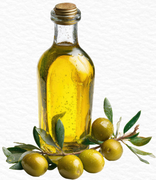
a good olive oil