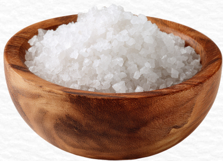
kosher & iodized salt