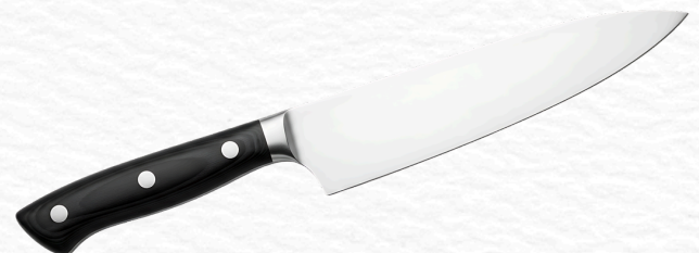
a good, sharp knife (you don't need 12 knives, just one good one)