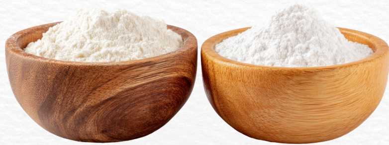
baking powder + baking soda (always needed for baking)