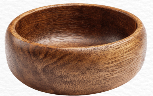
scrap bowl (keeps area much more tidy)