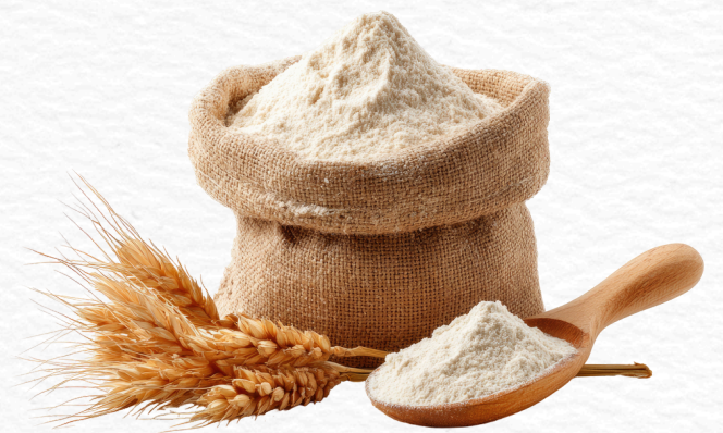
flour (a baking necessity)