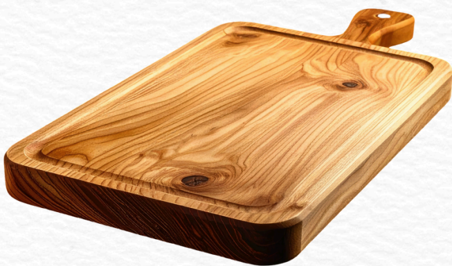
wooden cutting board (i dont like microplastics in my food)