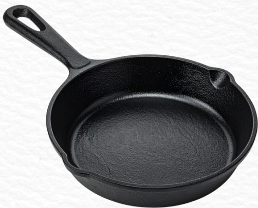
cast iron skillet (scary at first but worth it)