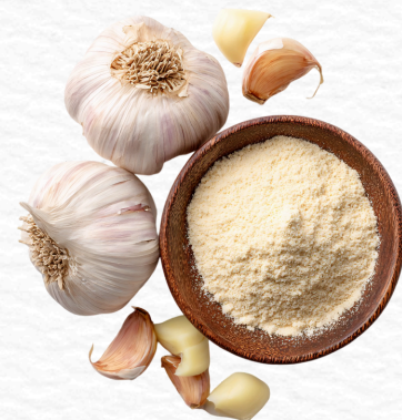
garlic + onion powder