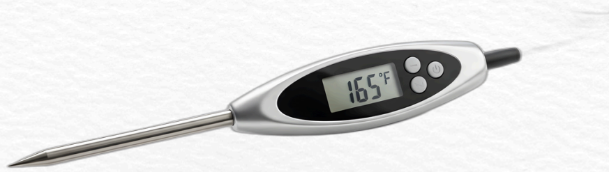
meat thermometer (makes life much easier)